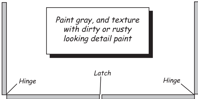
Fig. 3 - Upper view of completed "Set Up To Fail" jail cell