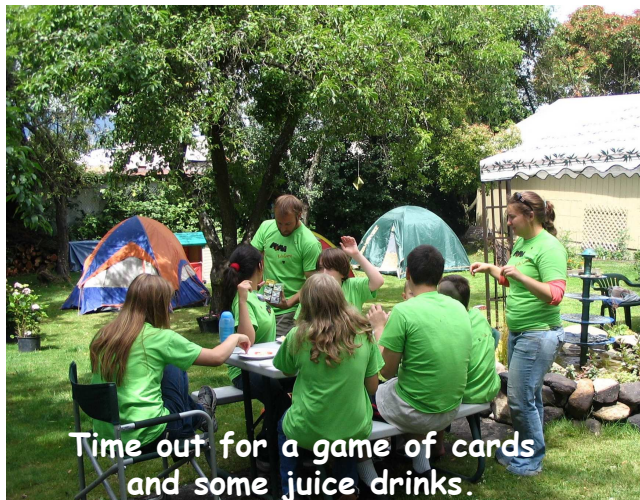
Time out for a game of cards and some juice drinks.